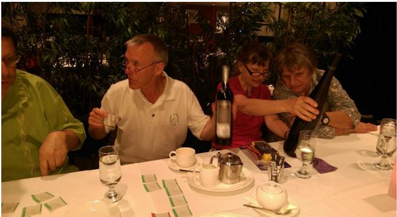
The ladies wondering where does this bizarre wine come from, I think it was from the Bavarian countryside!