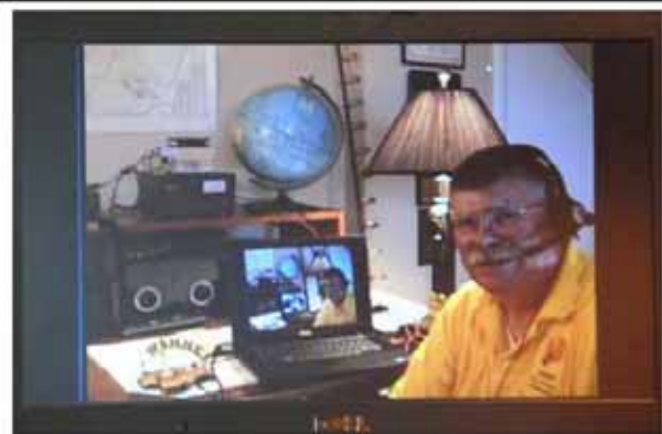
Figure 1 – W6HHC 1.2 GHz DATV Video being Received on SetTopBox/Notebook-Computer

The next step was to take the video display on the notebook computer and send it over the internet by SKYPE video-connection (called "shared-display" or "shared-desktop") to Peter VK3BFG, the net control station for the DATV QSO Party. See Fig 2 for a block diagram explaining the video signal path. Peter