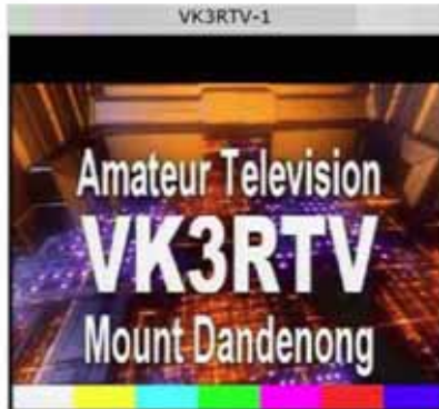
Fig 4 – Typical VK3RTV Repeater Test Pattern seen over the Internet