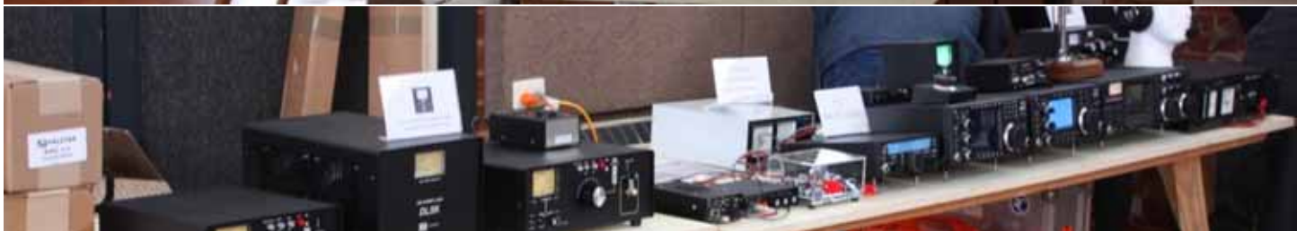
↓ Mick VK3CH / Trevor VK3ATX table of stuff on sale ↓